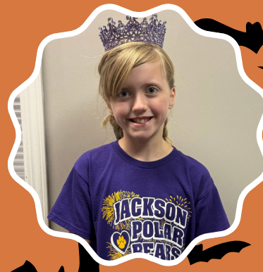
Charli Wolf Recreational